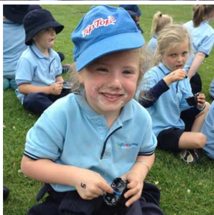
The best part of all and the smiles says it all.