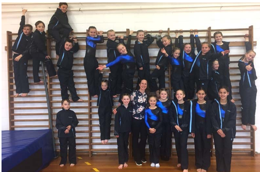
Salford Gymnastics Teams—who performed very well at the recent Gym Fest.